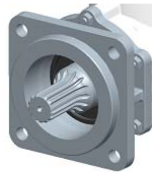
SAE C Flange