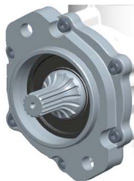
SAE B Flange

Improves vehicle fuel economy and performance