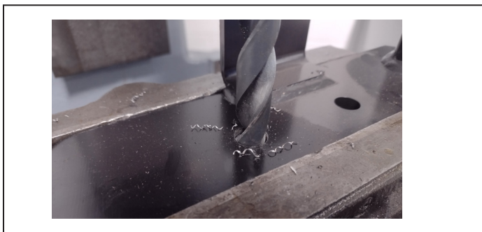
Figure 3 – Brake Pedal Modification