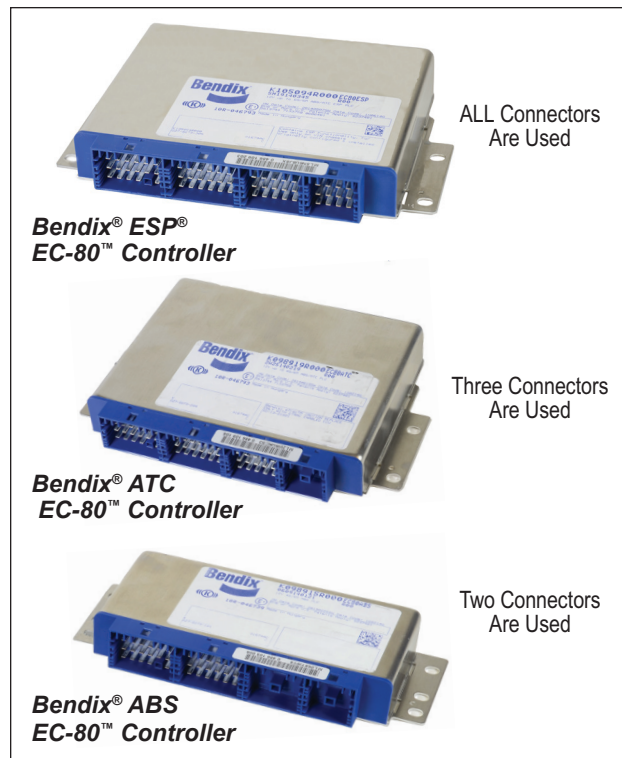
FIGURE 1 - THE FAMILY OF BENDIX® EC-80™ CONTROLLERS

Printed Copies: Literature can be ordered directly from the on-line Bendix Literature Center. To register or to access your existing account, visit www.bendix.com and click on the "Marketing Center" tab at the top of the bendix.com homepage, or use the link on www.foundationbrakes.com .