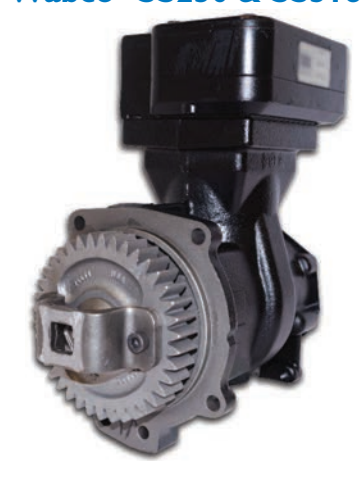
Wabco® SS250 & SS318 Series