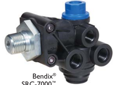
Bendix® SRC-7000™ Spring Brake Valve

In comprehensive testing conducted by Bendix Commercial Vehicle Systems LLC, our engineers compared the performance of the Bendix® SR-5™ valve and the new Bendix® SRC-7000™ spring brake valve to valves from leading competitors. The test evaluated overall durability, passable leakage, and valve element breakdown.