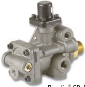
Bendix® SR-5™ Spring Brake Relay Valve

In comprehensive testing conducted by Bendix Commercial Vehicle Systems LLC, our engineers compared the performance of the Bendix® SR-5™ valve and the new Bendix® SRC-7000™ spring brake valve to valves from leading competitors. The test evaluated overall durability, passable leakage, and valve element breakdown.