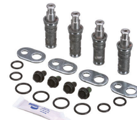
Cartridge Pressure Protection Valve (CPPV) Kit