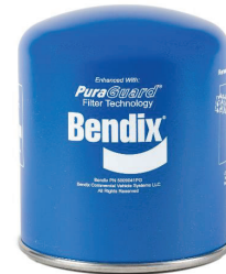
41 mm Oil Coalescing Cartridge