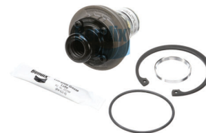
Purge Valve Kit

B2BENDIX.COM 24/7/365 ACCESS FULL SERVICE AT YOUR FINGERTIPS