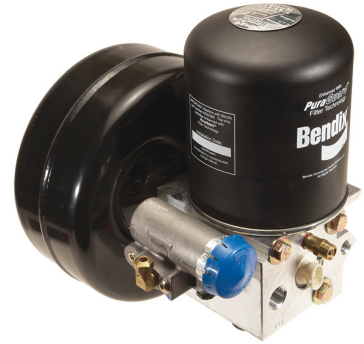
Bendix® AD-IS® Air Dryer with Purge Reservoir