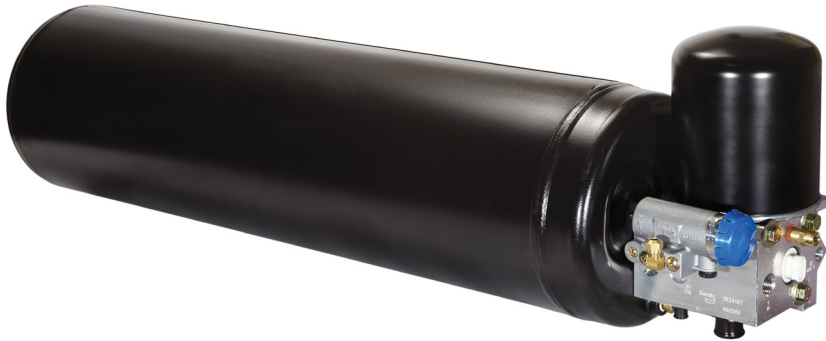
Bendix® Dryer Reservoir Module (DRM) with an AD-IS® Air Dryer