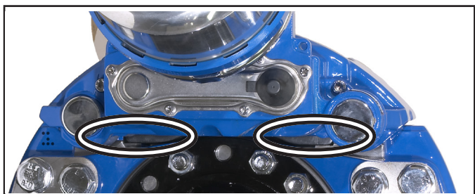
Figure 2 – Insert the Pad and Wear Gauge

(See Figure 1.) Slide the rotor measurement jaws until the rotor is held between them. Read the rotor thickness by the indicator against the gauge. (Use the temporary locks to hold the measurement until the pad measurement is complete.) The gauge shows between 30 mm and 50 mm. New rotors will show 45 mm, and the replacement point is 37 mm.