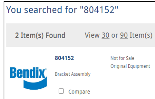
Figure 2 - Expand Details on Part Number Search