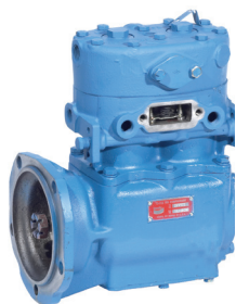
Bendix® Tu-Flo® 700 Compressor

Bendix® Tu-Flo® 600 Compressor Not Shown