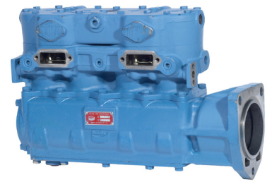
Bendix® Tu-Flo® 1400 Compressor