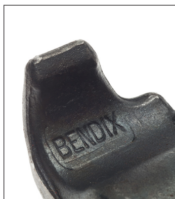
Figure 3 – Bendix Identification on Camshaft

RSD Cam kit part number K126580K must be used when servicing the RSD Cam to remain compliant with the RSD mandate. The kit consists of the following: