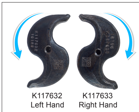
Figure 2 – Left and Right Hand Camshafts