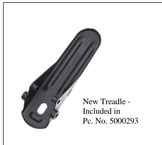
Figure 2 – New Style Treadle