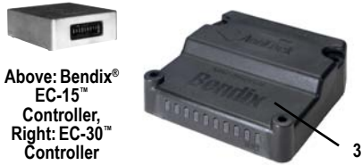
Above: Bendix® EC-15™ Controller, Right: EC-30™ Controller