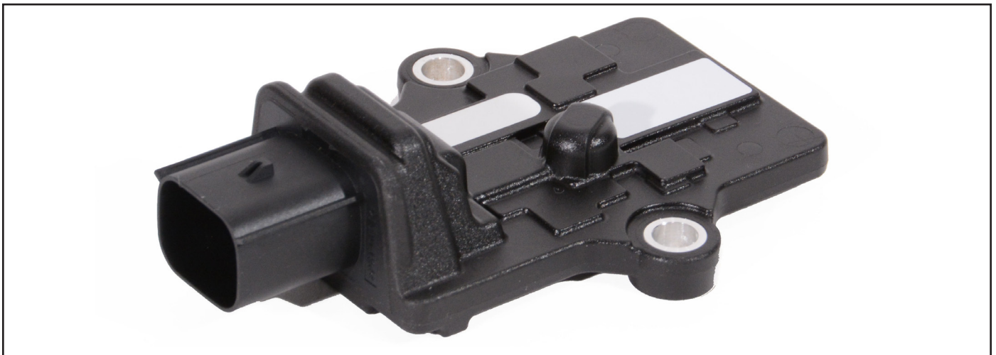
Figure 1 – SA-EAC

Bendix®-brand Electronic Control Units (ECUs) are not designed to store data for purposes of accident reconstruction, and Bendix® ACom® PRO™ Diagnostic Software is not intended to retrieve data for purposes of accident reconstruction. Bendix makes no representations as to the accuracy of data or video retrieved and interpreted from ECUs for purposes of accident reconstruction. Bendix does not offer accident reconstruction services or interpretation of stored data. Bendix ECUs are not protected from fire, loss of power, impact damage, or other conditions that may be sustained in a crash situation and may cause data to be unavailable or irretrievable.