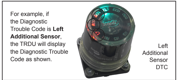
FIGURE 2 - EXAMPLE OF A DIAGNOSTIC TROUBLE CODE